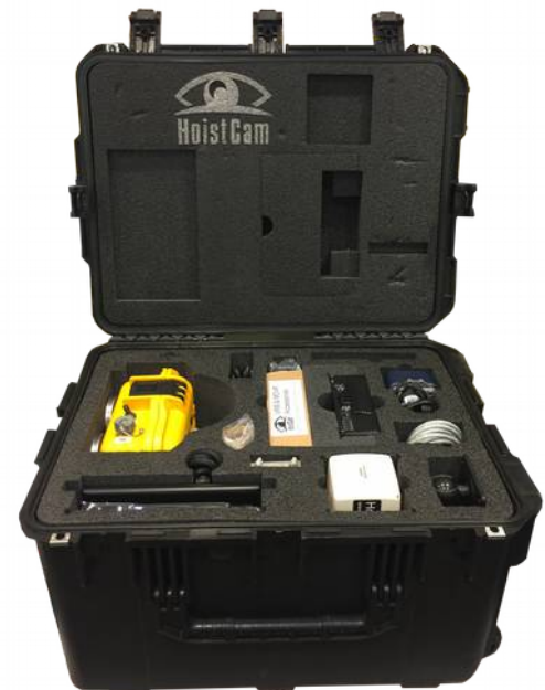
Rugged Transport Case for Rapid Deployment

Ask about available customization options specific to your crane application