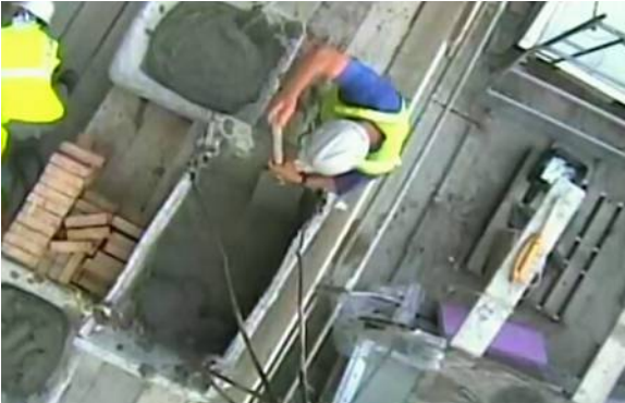
View from Crane Operator's Cab

The HoistCam™ HC170 is an ignition protection rated rapidly deployable wireless night/day camera platform. HoistCam places the eyes of the crane operator anywhere on the job. Safety is increased, and efficiency improved by making instant visual information available to those who need it.