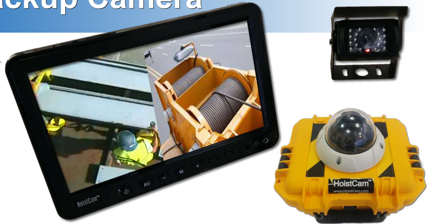
Split Screen Display with Wireless HoistCam and Wired Cameras

Split screen accessories with the HoistCam allow the operator to view multiple angles – including the video feed from the HoistCam.