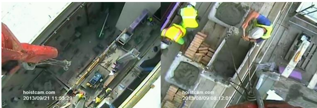
FIGURE 1 HOISTCAM -VIEW FROM CAMERA