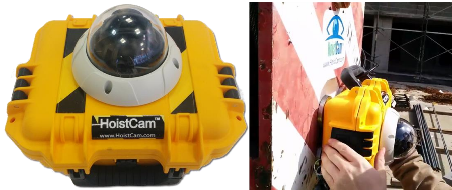
FIGURE 2 HOISTCAM (HC180&HC183)