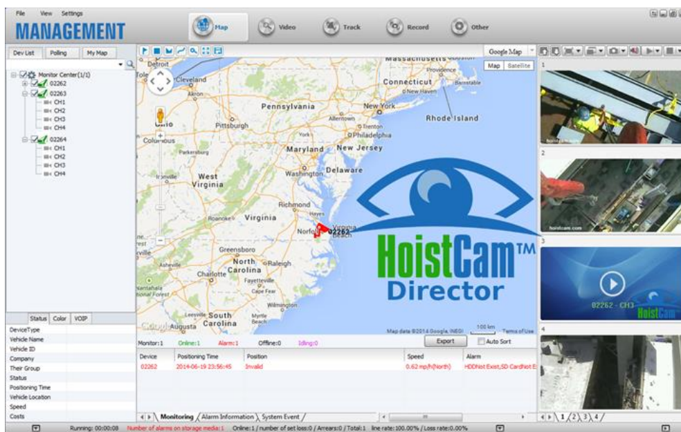
FIGURE 3 HOISTCAM DIRECTOR

the details of every lift. No more blind lifts or blind spots in equipment operations! The HoistCam system is very easy to install and does not require any drilling of holes into equipment or welding to mount and install. The HoistCam product line also includes a market leading optional remote monitoring, recording and management analytics capability for crane operators and site supervisors, called HoistCam Director. Other systems do not have this capability. Netarus' HoistCam Director enables centralized monitoring of the job site using HoistCam cameras or other cameras and even drones, all tied together and viewable through the HoistCam Director. The HoistCam SiteTrax.io is also available as an additional service to provide customized and automated analytic and reporting capabilities that include video records, safety analysis and 3D models. This analytics capability is unique to the HoistCam system.