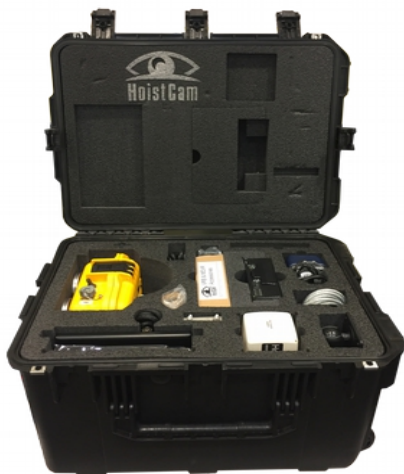
HoistCam in Ruggedize Transport Case